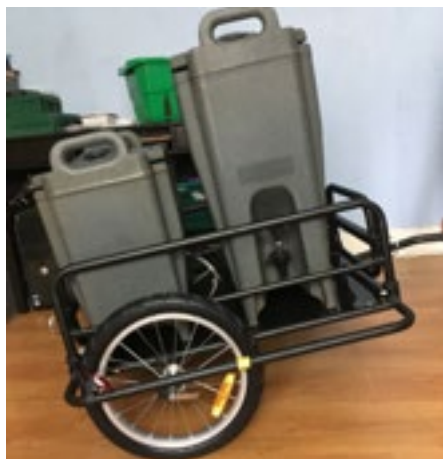
Our new bike trailer for outreach!

Lately we have had several ex full time volunteers come for a visit and stay a few days, jumping back into life in the house and getting stuck in with the team. It has been lovely to welcome some old friends back to the house and gives it a real family feel. We are not looking forward to the cold weather, but when it comes we will be ready for all the challenges it brings.